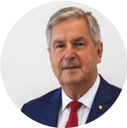
Rear Admiral the Honourable Kevin Scarce AC CSC RAN (Rtd) President, Novita