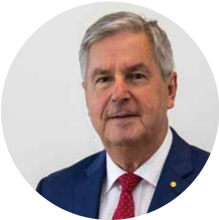
Rear Admiral the Honourable Kevin Scarce AC CSC RAN (Rtd) President, Novita

Everyone reading this report would understand how the impacts of the global pandemic have changed the way we live and work. For an organisation such as ours, with a core purpose of delivering services for the most vulnerable in our community, it has refocussed how we maintain support for our clients and families during the most challenging of times.