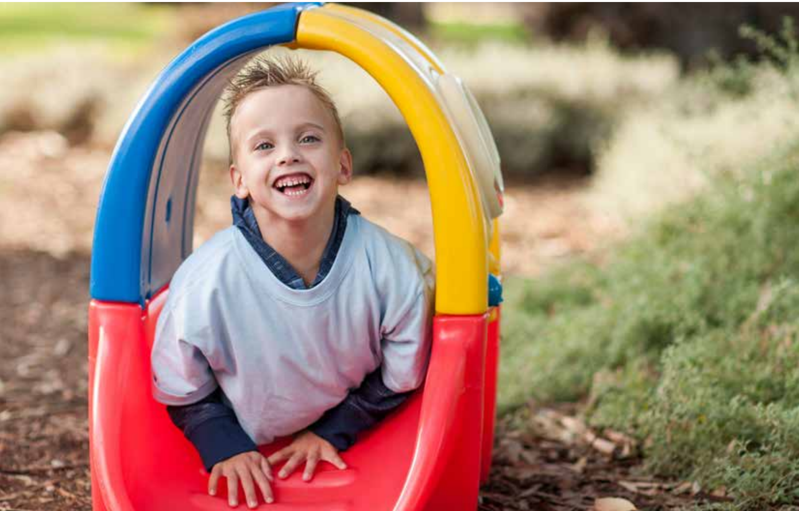
Beau loves to play