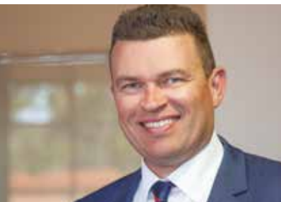
President Rear Admiral the Hon Kevin Scarce AC CSC RAN (Rtd)