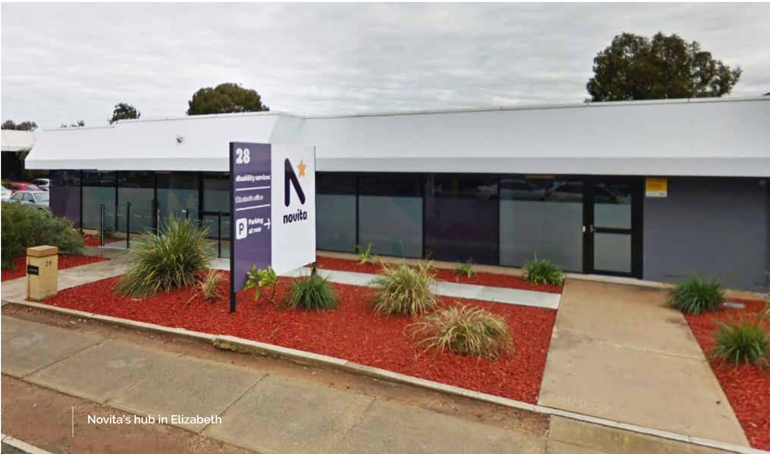
Novita's hub in Elizabeth