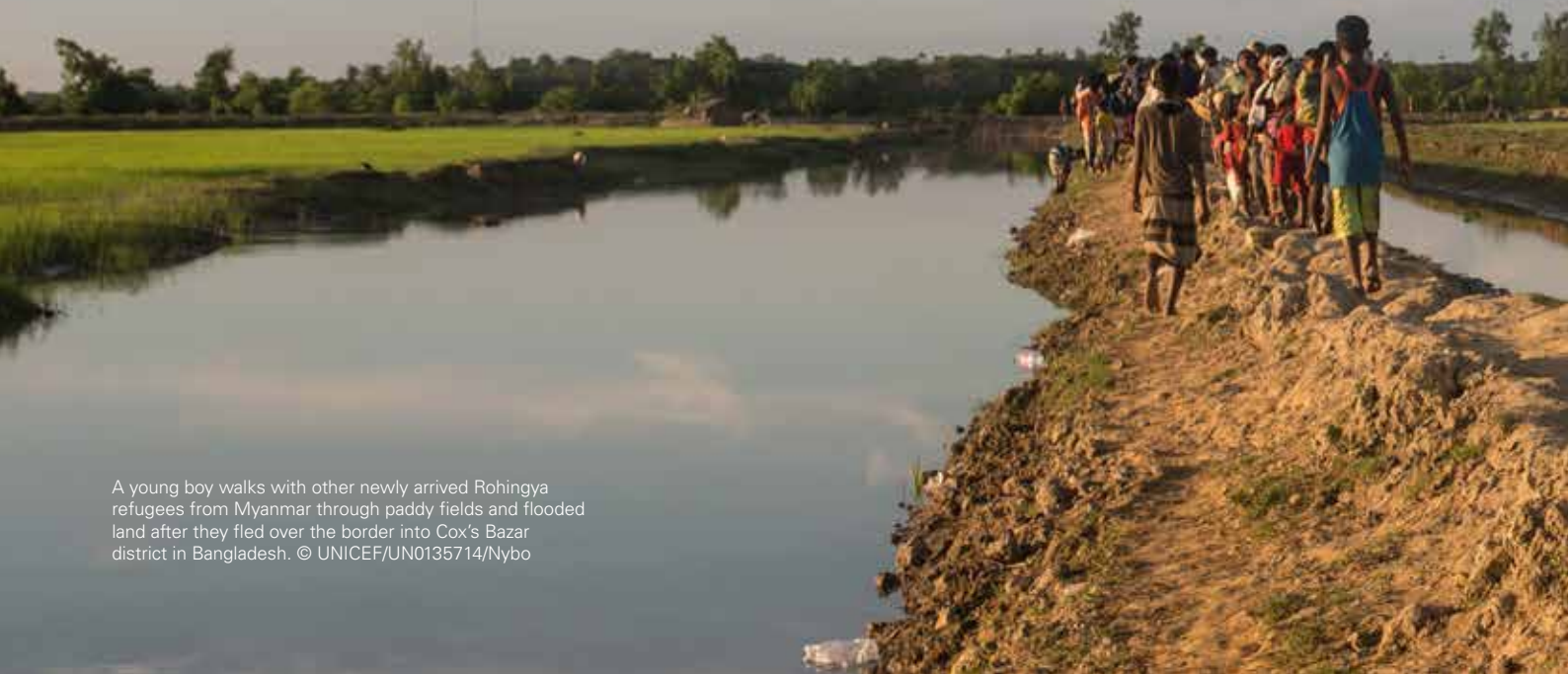
A young boy walks with other newly arrived Rohingya refugees from Myanmar through paddy fields and flooded land after they fled over the border into Cox's Bazar district in Bangladesh.