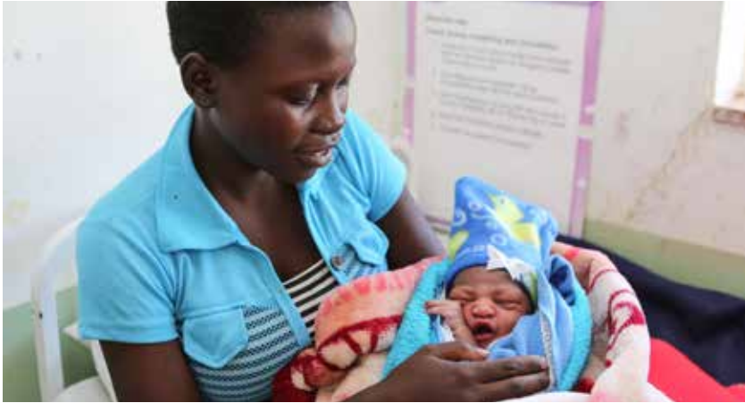
A woman and her infant await care at the Madamombe rural health centre in Chivi District, Masvingo Province.