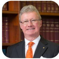
His Excellency The Honourable Paul de Jersey AC Governor of Queensland