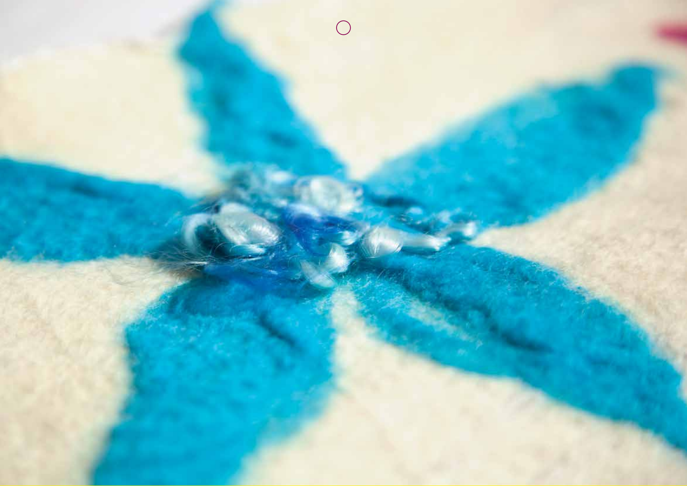
Felt Flower (close up) – Washed Merino Wool on Silk Artist: Group Collaboration, ECH Happy Valley