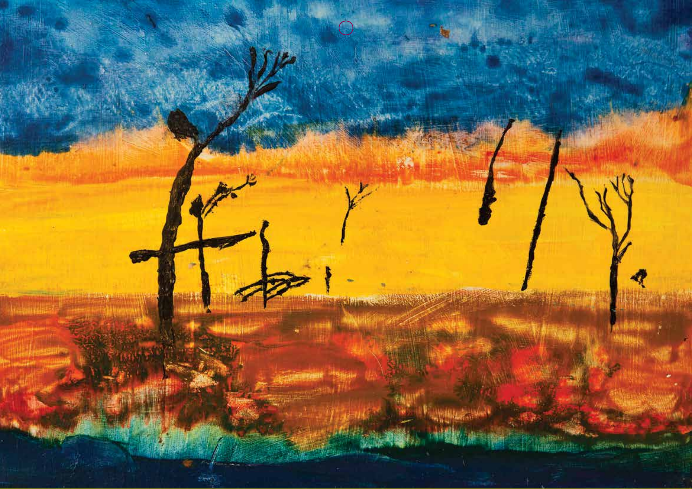
Landscape Blues Yellows Oranges - Acrylic Artist: Keith Manual, Client, ECH Happy Valley