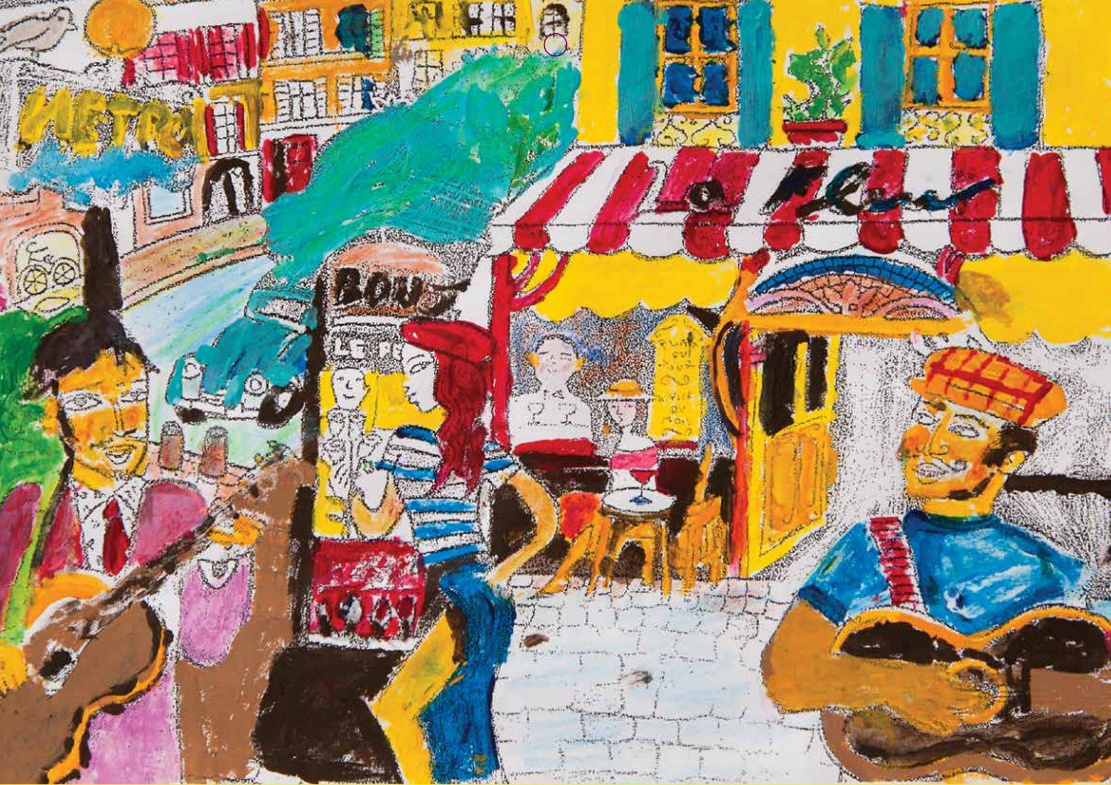
French Café - Watercolour Artist: Anonymous, Client at ECH