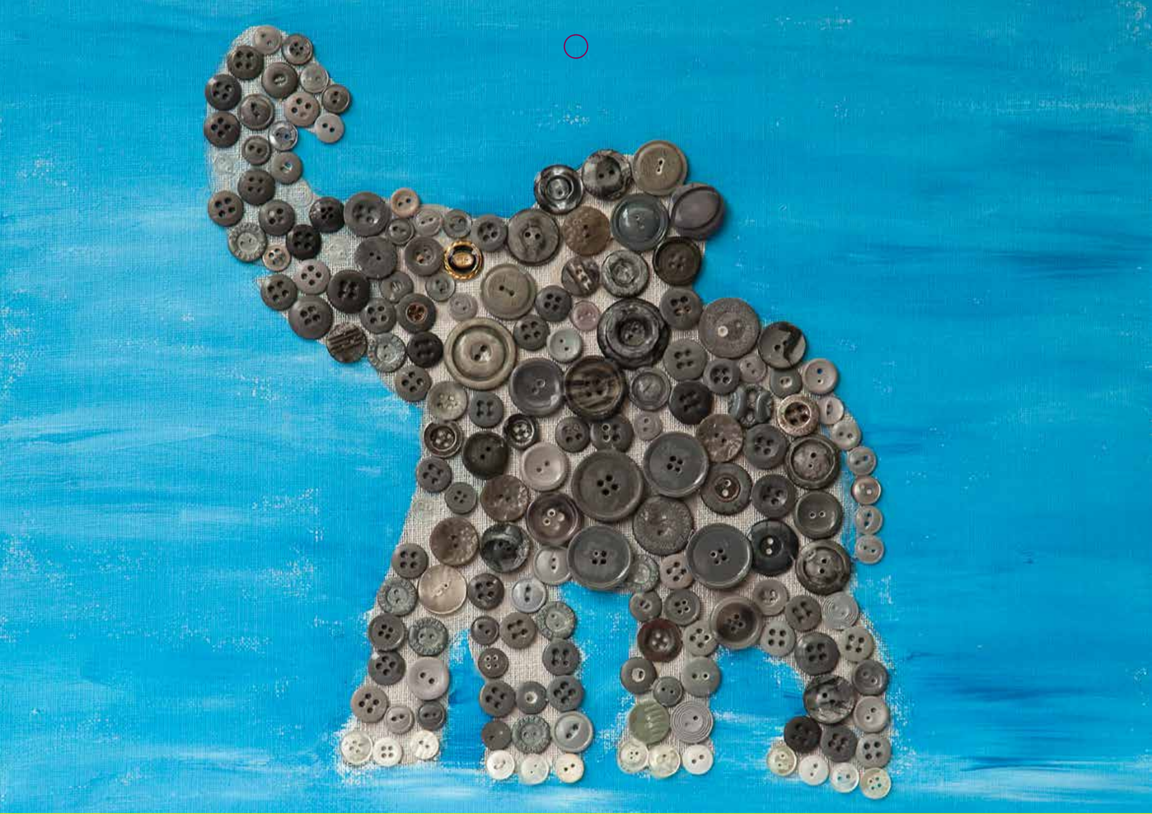
Elephant - Acrylic Button Art Artist: Group Collaboration, ECH Happy Valley