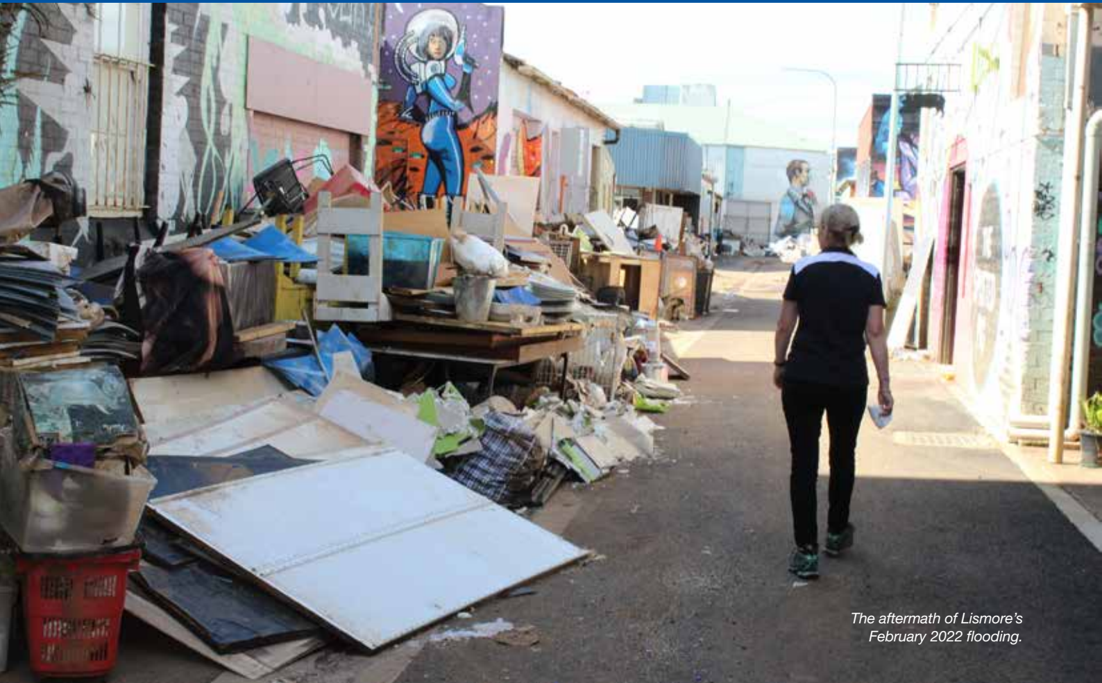
The aftermath of Lismore's February 2022 flooding.