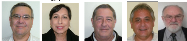
Chairman Deputy Chairman

The following persons were Directors of the Company during the year: