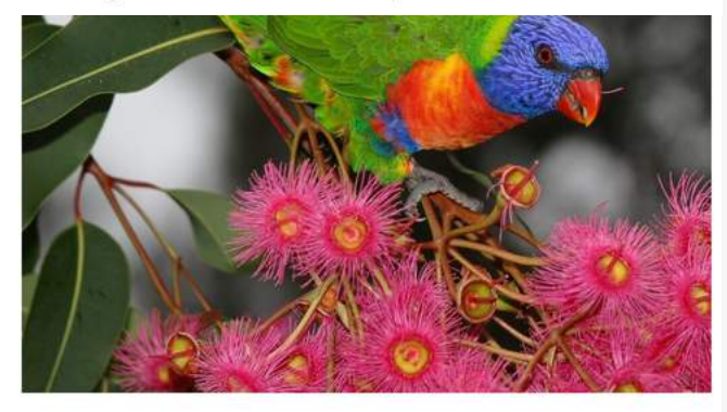
EPISODE 10 - HABITAT GARDENS - COMING SOON!

This film will feature interviews with some of the dedicated individuals who rescue, rehabilitate and release native wildlife, including some of our threatened species.